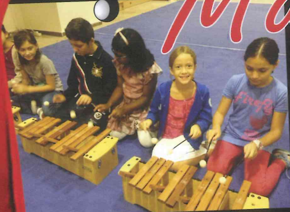
Grade 4 students accompanied many class songs using the xylophones.