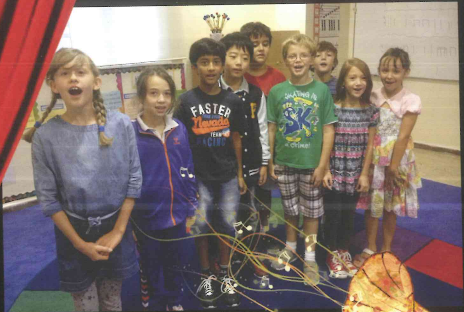
Students practiced singing the songs for our concert.