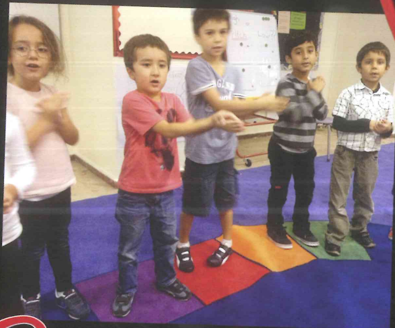
Grade 1 explored creative movement during our unit on expression.