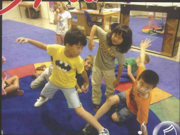
Grade 3 students struck a pose during an imaginative game to help us explore movement.