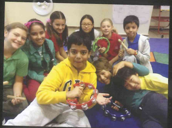
Students practice with classroom instruments during our rhythm notation unit.