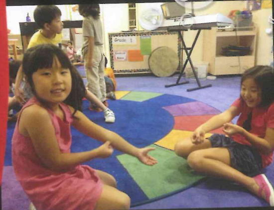
Exploring the use of movement and pantomime.